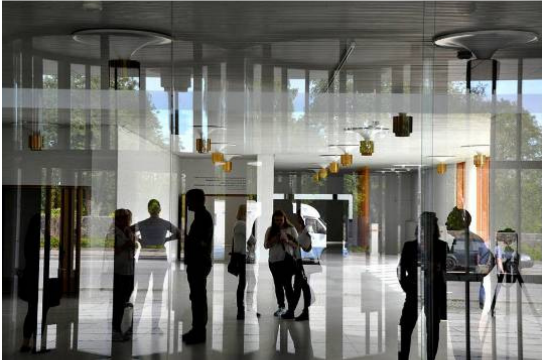
Instawalk with Instagrammers Aalborg in the empty Art Museum; Kunsten, facilitated by the City Archives (photo: Klaus Holm Neve).