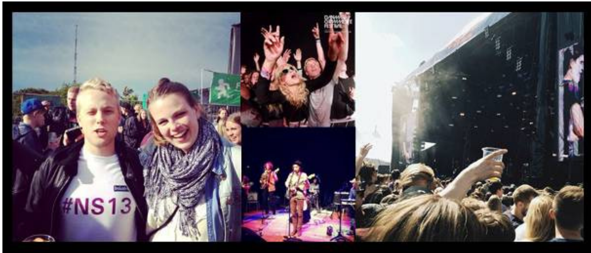
Insta photos from #NS13 NorthSide Music festival in Aarhus. Campaign hash tag promoted via t shirt.

The Old Town Museum has directed their focus of the digital curating on Instagram to the theme: Popular music, as the project was a part of the preparation of an exhibition about contemporary popular music in Aarhus from 1960ies-2014 that opened in May 2014: "Aarhus Rocks". The museum initiated close cooperation with the organizers behind three local music festivals: Spot, "Grimfest" (the ugly party), and NorthSide alongside with the Danish Journalist and Media School in Aarhus. The museum wanted to collect photo material that illustrated the experience of live music today. They selected media platforms where the young people and festival visitors already felt at home as a part of their daily lives. Hash tags were introduced and media students acted as digital reporters on the festivals promoting the hash tags and the project with flyers etc. The campaign was a success; at the SPOT festival (#spot13) 1000 photos were uploaded in two days, at Northside (#ns13) 11.000 photos were uploaded after a week and #grimfest generated 500 photos. The 13000 photos were analyzed and divided into themes: The music and concerts (31 %), me and my friends (27 %), the atmosphere (20%), festival logos (14%). A minor part of the photos will be saved permanently in the collection. The photos are now a part of the exhibition, Aarhus Rocks, in their original form as Instaphotos shown on screens.