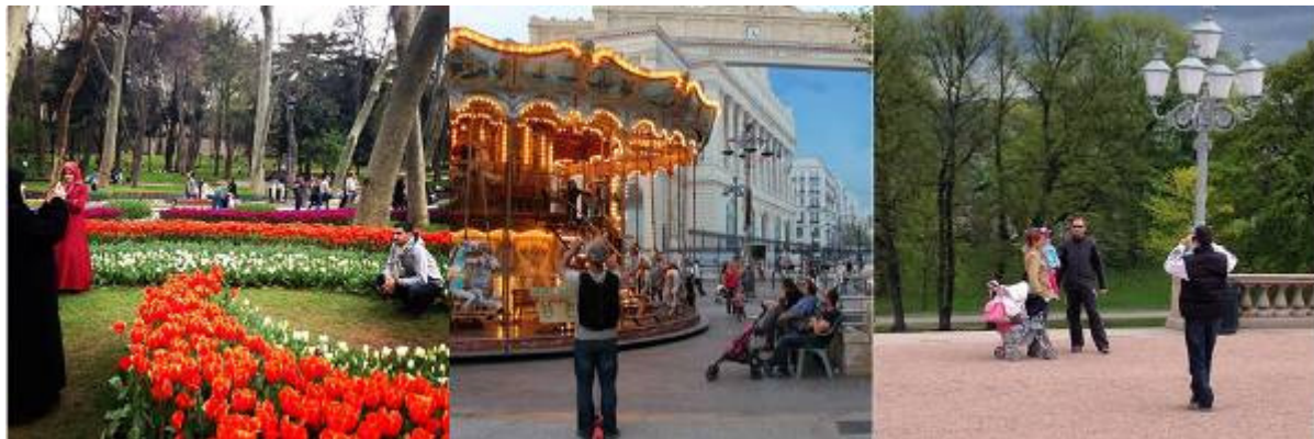
Istanbul, Marseille, Oslo, everybody is doing it – smart phone photography

A majority of us takes photos and videos anywhere, anytime, of anything and everything on mobile devices, on tablets and smart phones cameras, and share them with each other. It happens across cultures and on a global scale. Photography is already a common cultural practice, but with smart phone photography it becomes an even more inherent aspect of everyday life and mediates social relations (Lee, 2010, Van House, 2011). People have adopted the new photo sharing services and ways of photography with breathtaking speed.