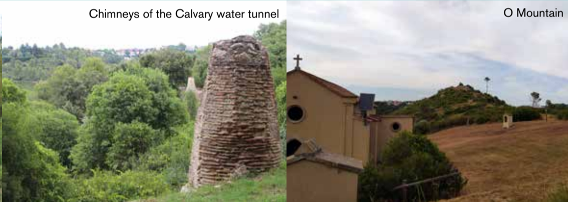
Chimneys of the Calvary water tunnel