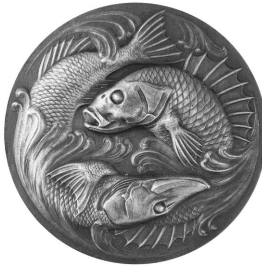
Fishes, The fishing , Charles Virion, c. 1930, 50 ø mm, bronze

The show is structured into six sections dealing with the main themes: “A Homage to Remember” centres on portraits that honoured people; “The Face of the Country: Monarchies and Republics” is concerned with an institutional perspective; “The Faces of War” remembers the many faces of conflicts; “Symbology in Religious Portraits” reveals their spiritual message; “Allegories, or the Modern Classic” is devoted to the myriad allegorical representations, some new at that time, such as photography and sport; and finally “They Too Are Portrayed” engages with different animals, likewise portrayed for their character and physiognomy.